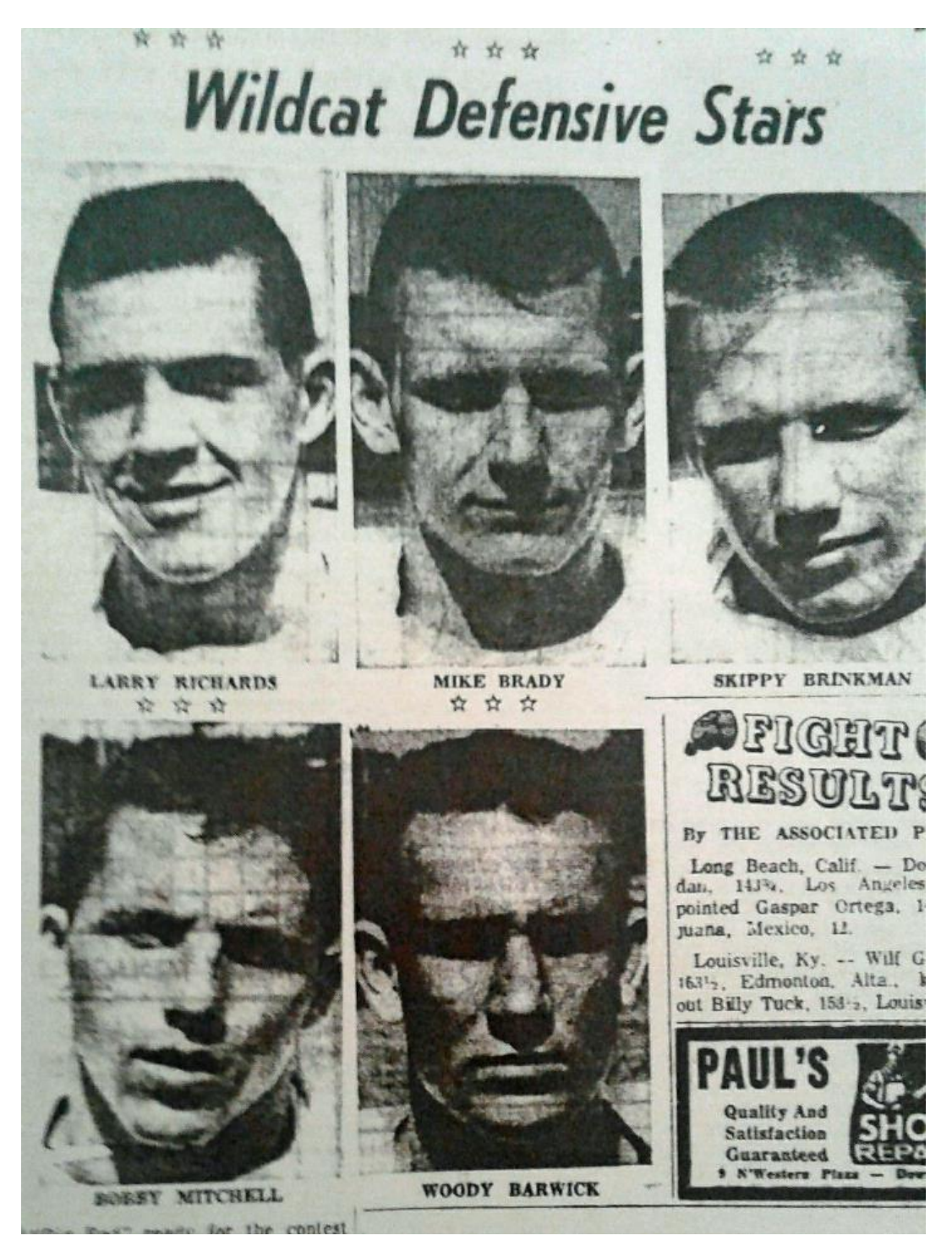
Photos of some of the players as shown in a photo in The Oak Ridger at the time

(As published in The Oak Ridger's Historically Speaking column the week of October 23, 2018)